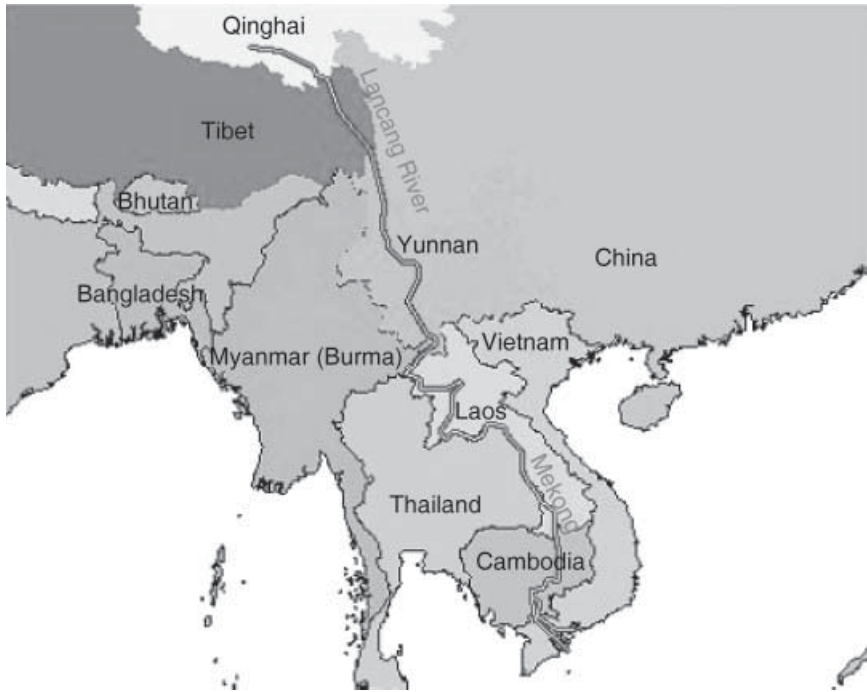
Figure 1 Greater Mekong Subregion

5 different nations: China, Thailand, Burma, Laos and Vietnam. Culturally and linguistically, Yunnan (and especially the Xishuangbanna Autonomous Prefecture) is closely related with its neighbors through Tai and minority groups straddling national boundaries and, increasingly, moving between national territories (Hinton, 1998). It is only since the mid-1980s and the normalization of Chinese relations with its Southeast Asian neighbors that Yunnan has started working to establish subregional economic cooperation.